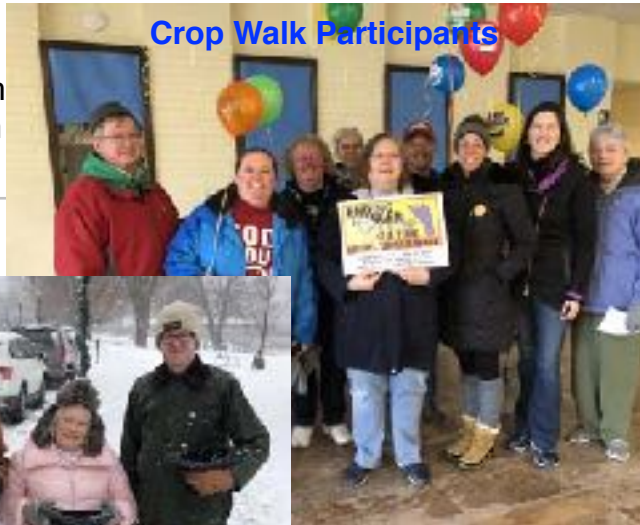
Crop Walk Participants