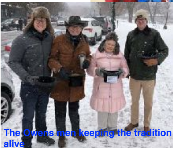
The Owens men keeping the tradition alive