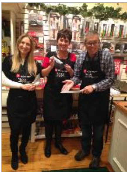
Knife sharpening at the Rhubarb.

We have received many thoughtful donations to the Pantry over this past holiday season. State Street helped with the baking and had a food collection. This past February Waterman School's students contributed to the "Souper Bowl" theme with cans of hearty soup for our patrons.